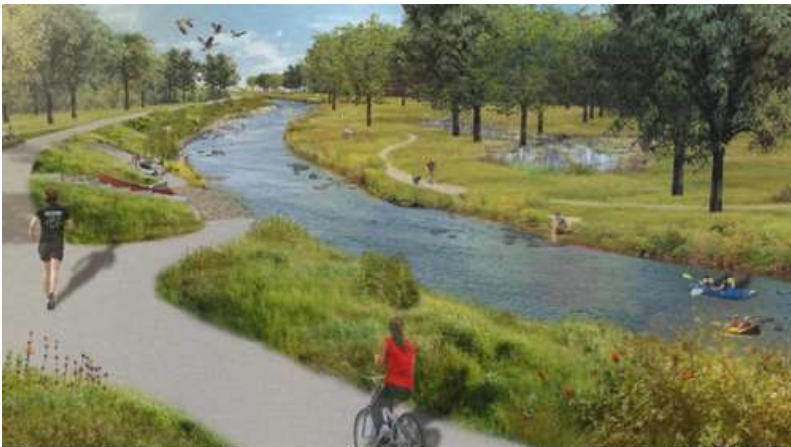
Portneuf River Vision (2016): Concept Rendering of Centennial and Rainey Parks looking north (downstream) toward Historic Downtown Pocatello